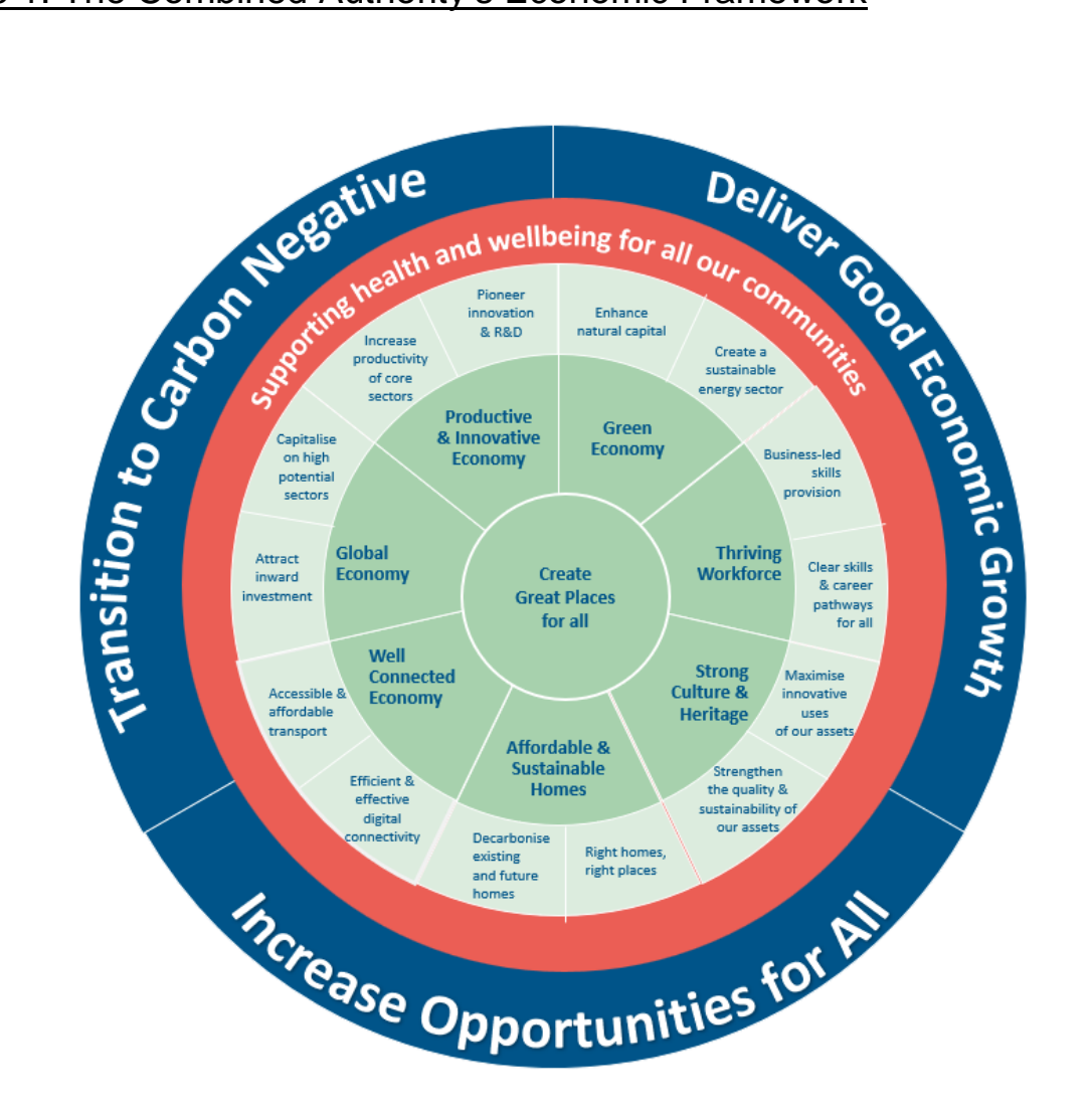
Figure 1: The Combined Authority's Economic Framework

16. To note, in response to the Mayor's pledges, an initial, high level overview of key priorities has been developed by the Combined Authority that builds on the economic framework. This is presented in a paper at the Combined Authority on 31 May 2024 and is shown below